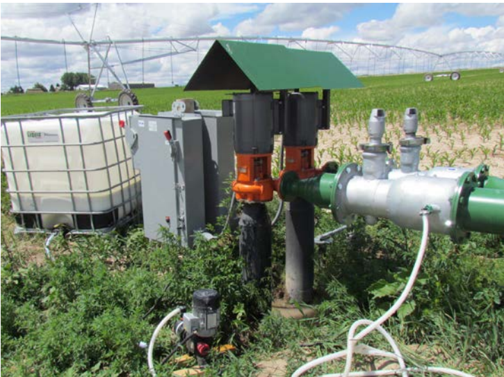
Electrical Interlock (shuts down chemical pump when irrigation pump shuts down)