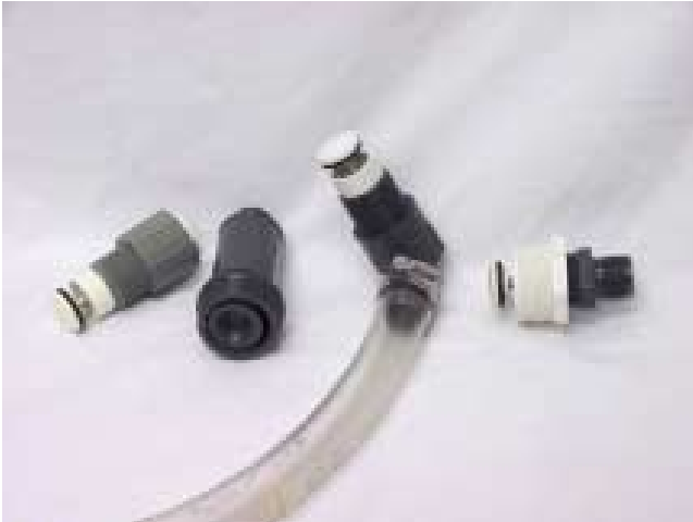
Low Pressure Drain Valve with Hose