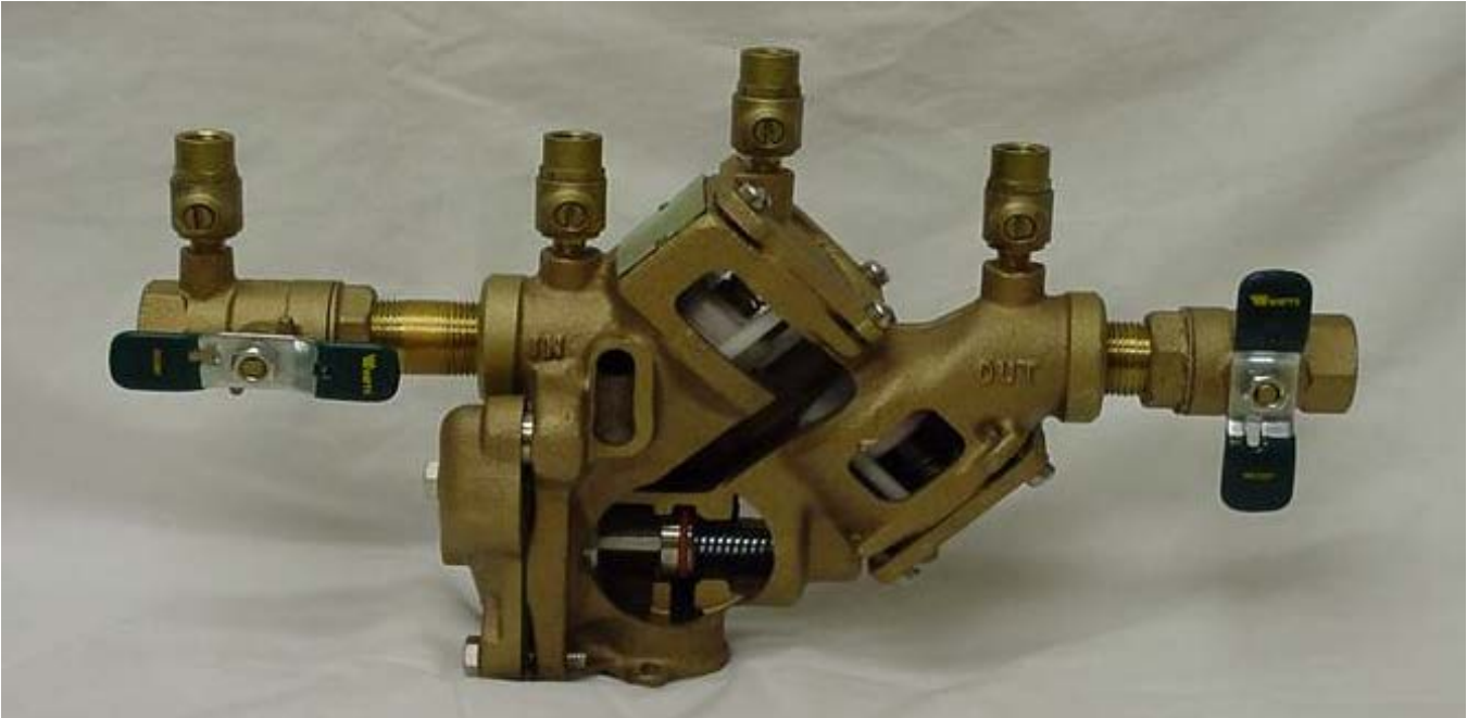
Reduced Pressure Backflow Device (RPBD) for use with domestic or municipal water supplies (usually used in greenhouses)