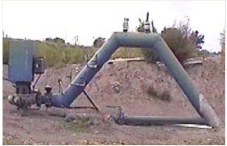
Gooseneck Pipe Loop (alternative to chemigation valve, not allowed for use on deep well pumps)