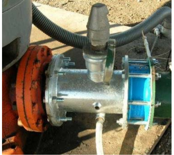
Split Disk (Wafer Check) valve with spool