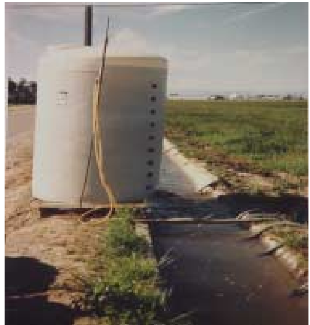
Fertilizer tank application downstream side of weir only