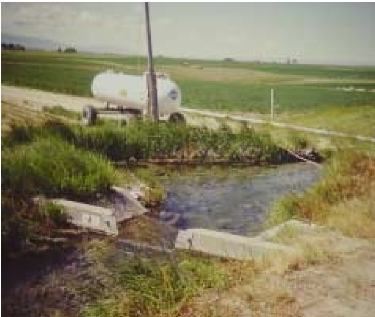
Anhydrous Ammonia application downstream side of weir only