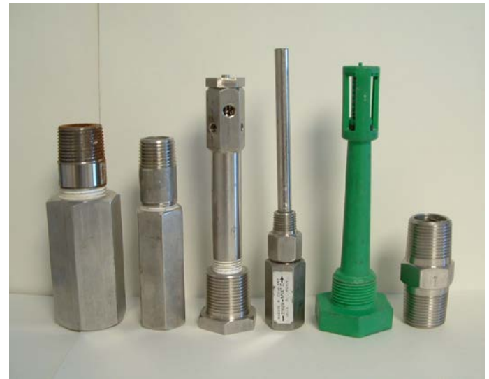
Injection Line Check Valve (prevents backflow of irrigation line water into chemical tank)

Use only ISDA Approved chemigation equipment. A list of approved equipment can be found on the ISDA web site, the ISDA main office in Boise or at the ISDA field offices.